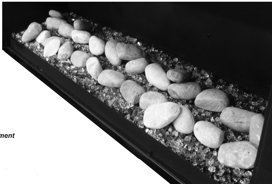
Figure 39 - Stone Placement